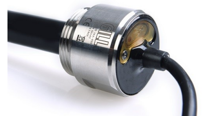
Sensor with sealed electronics