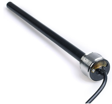
Sensor length up to 2m