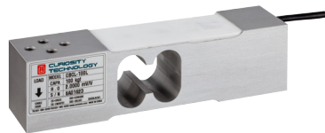
60L ~ 200L