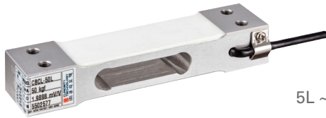
5L ~ 50L

5, 6, 10, 15, 20, 30, 50, 60, 100, 200 kgf